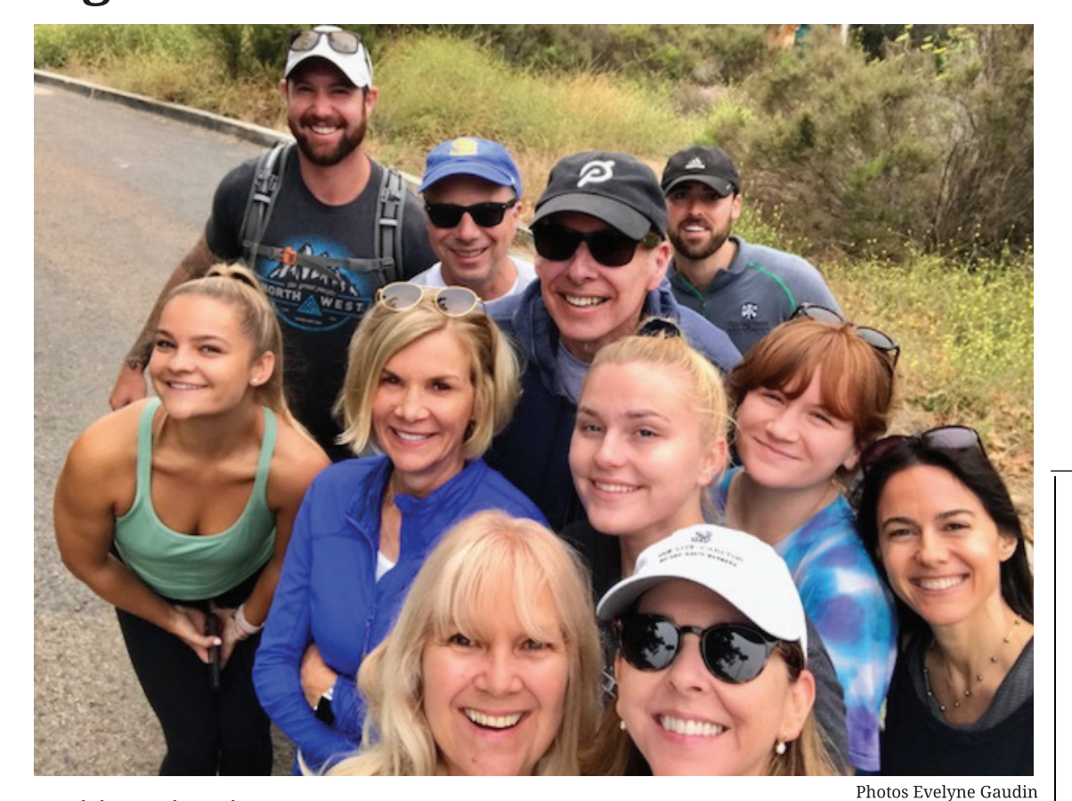
Participants in a Signature Retreat.